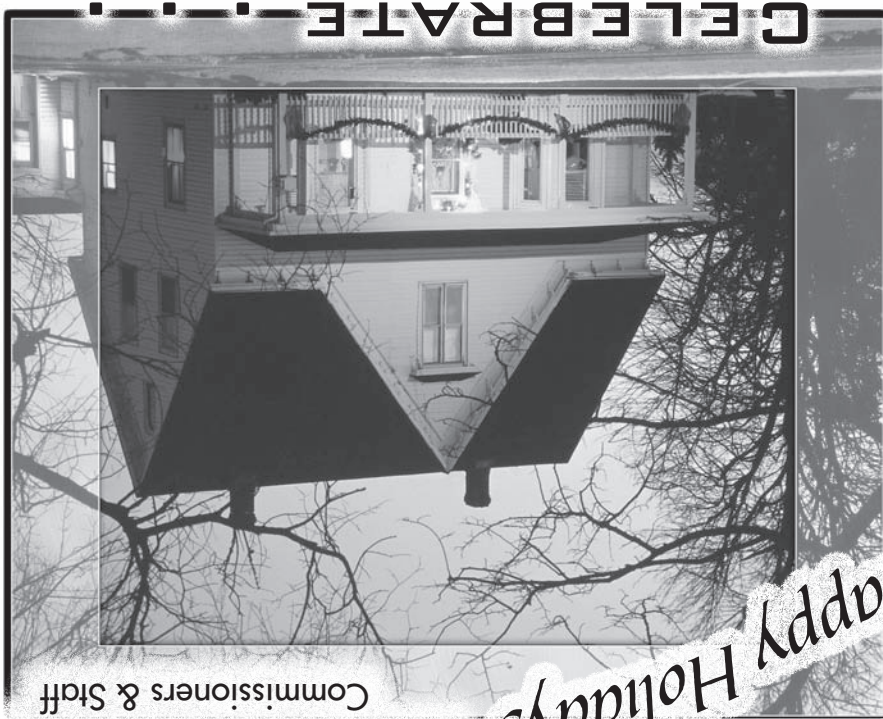
From the North Dakota Real Estate Commissioners & Staff

THE TRADITION OF FRIENDSHIP, THE BEAUTY OF THE SEASON, THE OPPORTUNITY OF THE NEW YEAR